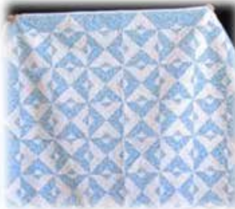
Perhaps, it's Becki!

Who is behind quilt number one and quilt number two???