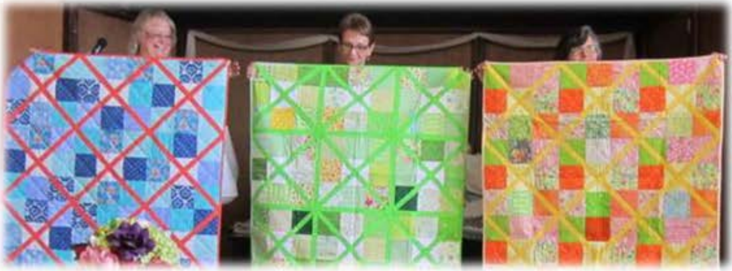
Georgeanne, Linda and Lynette show their quilts from the same pattern but with different color variations. Below are four more quilts all from the same pattern.